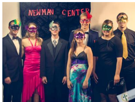
Newman Center Masquerade

Events such as these are instrumental in forming young Catholics in their faith. First, it reminds students that Catholicism is not simply a stagnant set of dogmas and rules that they must memorize and by which they must abide. Rather, it is a dynamic faith that one lives in the context of a community, and which informs everything they do, even their recreation. Likewise, to host an event for the entire campus helps students grow in the virtues of generosity and hospitality, and affords them a context in which to publicly witness to their own faith. Finally, it provides them with a project for which they are responsible from start to finish, helping them to develop a deeper sense of community and connection to one another. The death of a fictional character and the cost of food for sixty people seems a reasonable price to pay to achieve these ends.